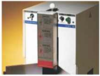
● safety paper fixer device