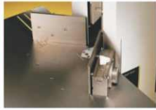
● micro-adjusting device