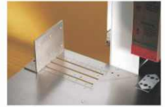
● open throat with adjustable scales