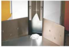
● patented thin die design + POM base die