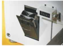
● 2 die storages on each side